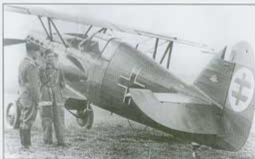
Avia B-534 fighters of the 37th (soon to be 13th) Squadron. The second version of Slovak markings is seen, supplemented with German crosses, in use from 10th September, 1939 until 15th October 1940. The first version of Slovak markings, in use from 23rd June 1939, had no white outline.