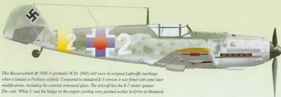
This Messerschmitt Bf 109E-3 (probably W.Nr. 2945) still wore its original Luftwaffe markings when it landed at Pietlany airfield. Compared to standard E-3 version it was fitted with some later modifications, including the external armored glass. The aircraft has the E-7 model spinner. The code "White 2" and the badge on the engine cowling were painted earlier in Gröve in Denmark.