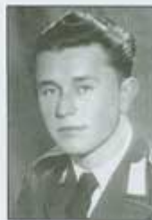
Ján Režbák, a future top Slovakian fighter ace.

The case for the authenticity of the victories is therefore strengthened not only by the fact that 215 of 13th Squadron's victories were recognised, but also by the fact that nearly 30 more were not confirmed. Leading specialists who have compared German claims with real Allied and Soviet losses consider that the differences between claimed and real losses are relatively small.