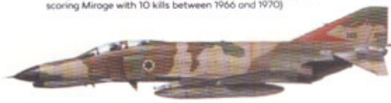
F-4E Phantom II no. 146, the Bat Squadron, 1973