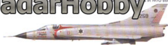
Mirage IIIc no. 59, First Fighter Squadron, 1967 (IAF's highest scoring Mirage with 10 kills between 1966 and 1970)