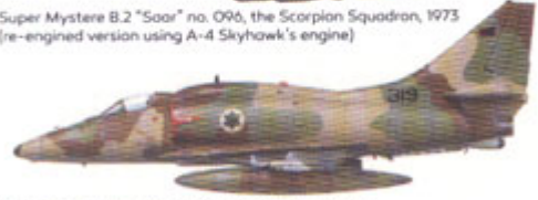
A-4N Skyhawk no. 319, the Dragon Squadron, 1973