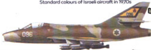
Super Mystere B.2 "Saar" no. 096, the Scorpion Squadron, 1973 (re-engined version using A-4 Skyhawk's engine)

Standard colours of Israeli aircraft in 1970s